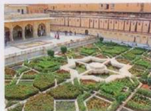
Discover the ornate symmetry of Charbagh garden in Rajasthan

View the sights of Shimla, the hill station surrounded by pine, cedar, oak and rhododendron forests. After lunch explore the gardens of the Viceregal Lodge, an