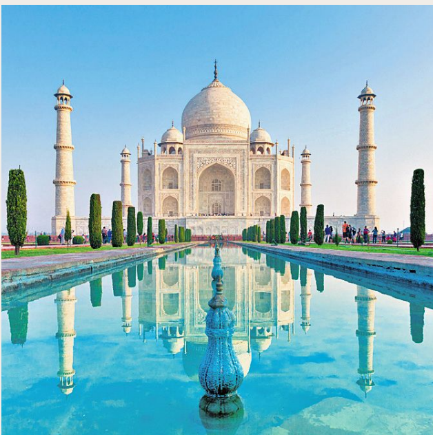
Take in the region's great sights, including the Taj Mahal