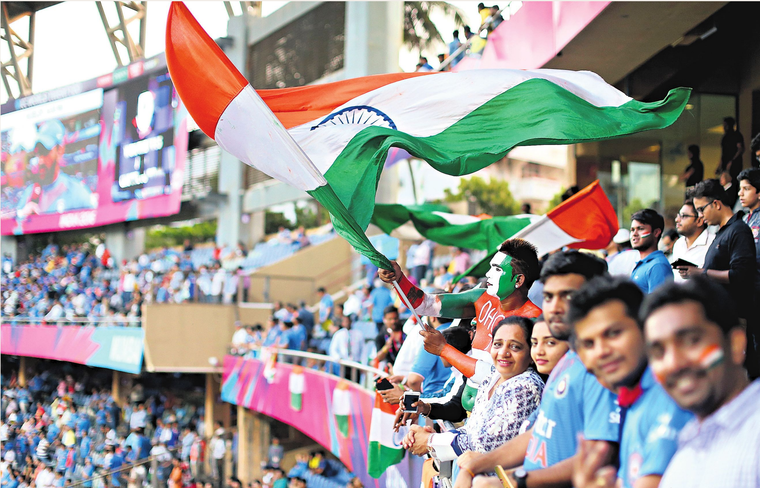
The atmosphere of a cricket match in Mumbai's Wankhede Stadium makes for one of the world's great sporting occasions

Allan Lamb Arriving from his native South Africa in the late Seventies, Lamb carved a career as a swashbuckling batsman for both Northamptonshire and England, for whom he amassed more than 4,500 Test runs and played in 122 one-day internationals. He can now be found lending his expertise to cricket coverage on the radio and on television.