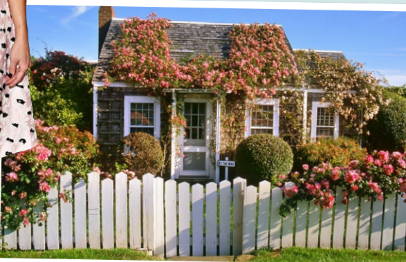
PRETTY IN PINK: A rose-covered Nantucket cottage and Martha's Vineyard fan Reese Witherspoon