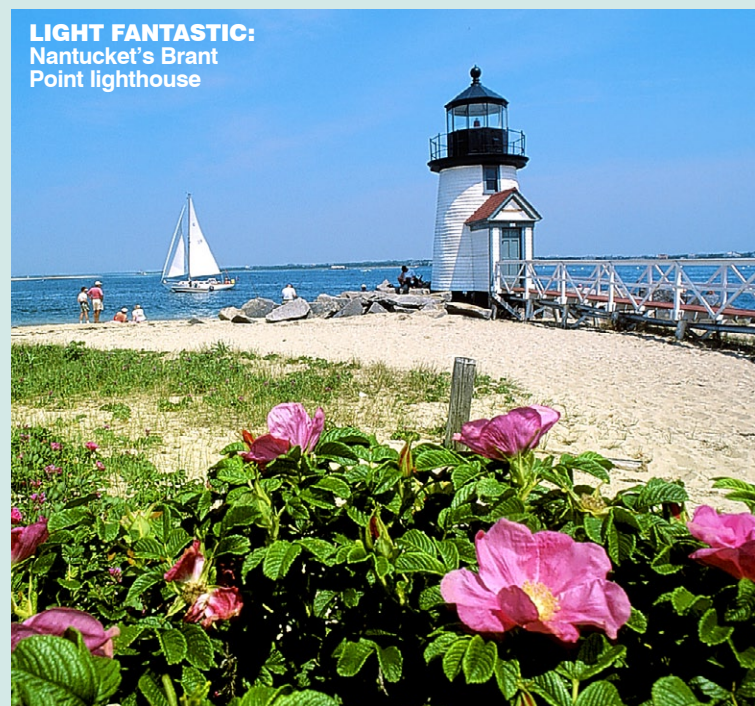
LIGHT FANTASTIC: Nantucket's Brant Point lighthouse

Plymouth Rock (although historians dispute the exact spot) on the Mayflower, Cape Cod became a key part of American history. For an authentic Cape Cod experience, stay at the Chatham Bars Inn, an imposing hotel which has strong echoes of The Great Gatsby about it.