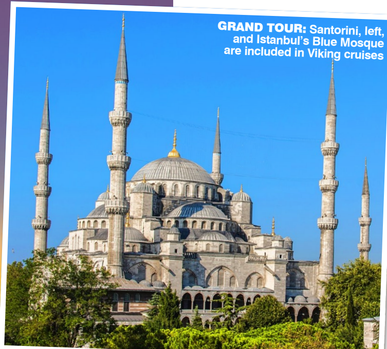
GRAND TOUR: Santorini, left, and Istanbul's Blue Mosque are included in Viking cruises