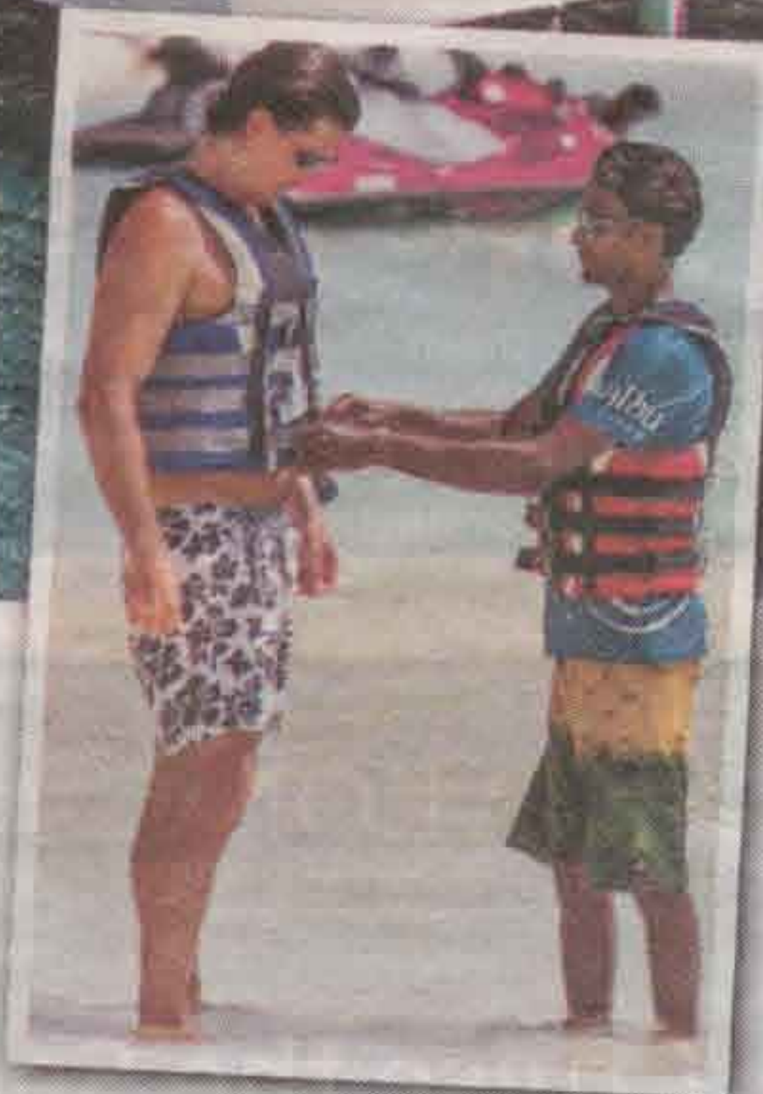
Straight out of the box: The new resort at Amilla Fushi, where you can try watersports (Inset)

Bungalows on the water, huts in the trees, a cinema under the stars — this is luxury of a crazy new kind